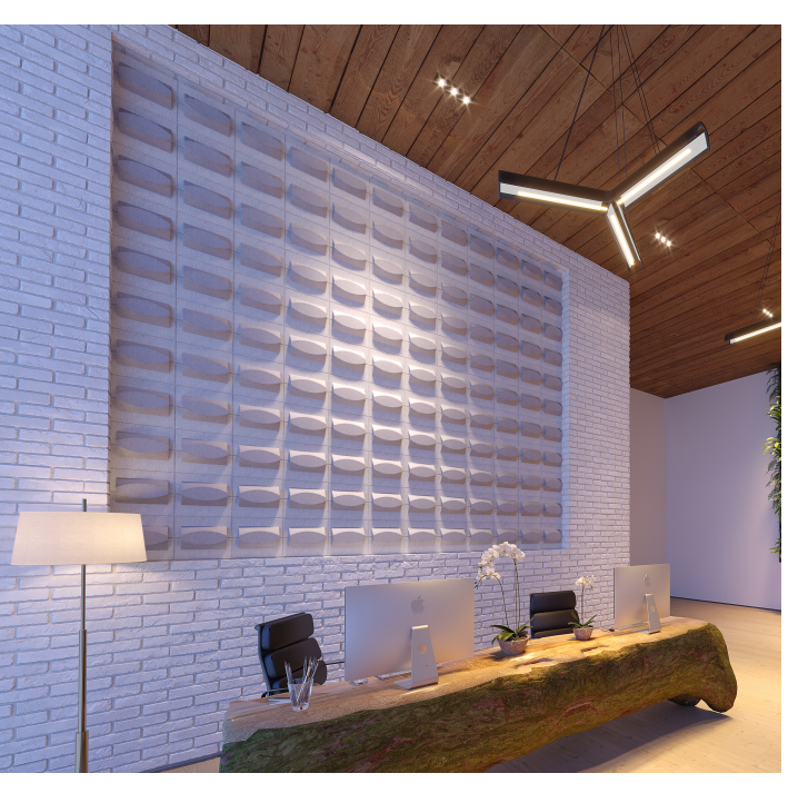
Shown as Saddle up only

Simply by changing their orientation or combination of tiles on the wall, you can create an unlimited variety of patterns.